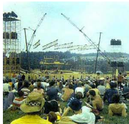
Aug. 15-17 The Woodstock Music Festival is held in upstate New York, featuring musicians such as Janis Joplin, Jimi Hendrix, and the Grateful Dead.