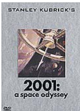
Stanley Kubrick's masterpiece "2001: a space odyssey" is released