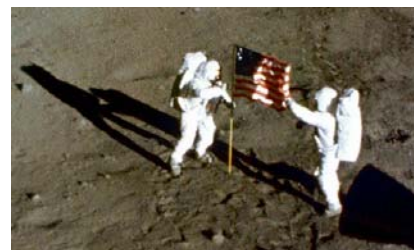
July 20 Neil Armstrong and Edwin "Buzz" Aldrin in the Apollo 11 become the first men on the moon.